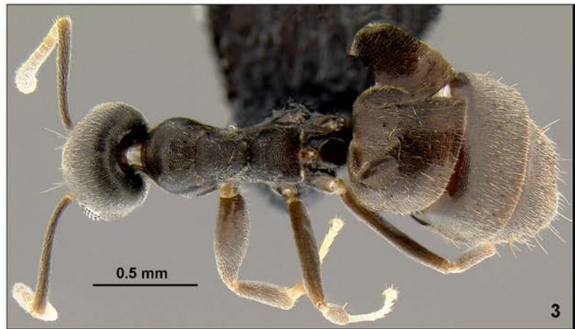
Figs. 1 - 4: Technomyrmex difficilis . (1 - 3) Worker from 10 km NW Lockhart River, Australia (CASENT 0171131), (1) head, (2) lateral view, (3) dorsal view. (4) Worker tending a mealybug, Cape Tribulation, Australia.

identity of most published " T. albipes " records from the Old World without examining the specimens. BOLTON (2007) believed that all recently published records of T. albipes from Australia were probably misidentified T. difficilis , as were at least some published records from Pacific islands in WILSON & TAYLOR (1967). But, as BOLTON (2007) pointed out, in the absence of specimens, the actual identity of a great many published T. albipes records "must remain equivocal".